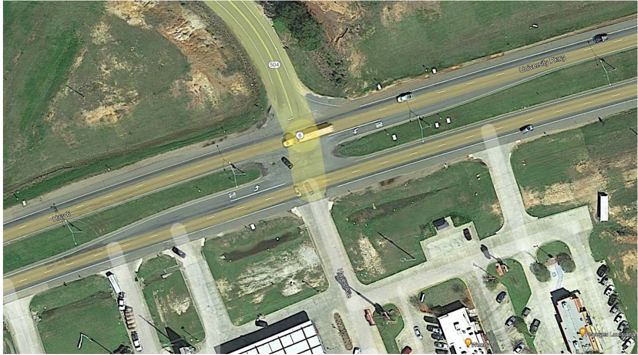
Figure 1: Location of Proposed Project

The project being proposed by Louisiana Department of Transportation and Development (LADOTD), using federal funds, is located on at the intersection of LA 504 and LA 6 in Natchitoches Parish, Louisiana. The proposed scope of this project includes the construction of a double-lane roundabout with associated drainage work.